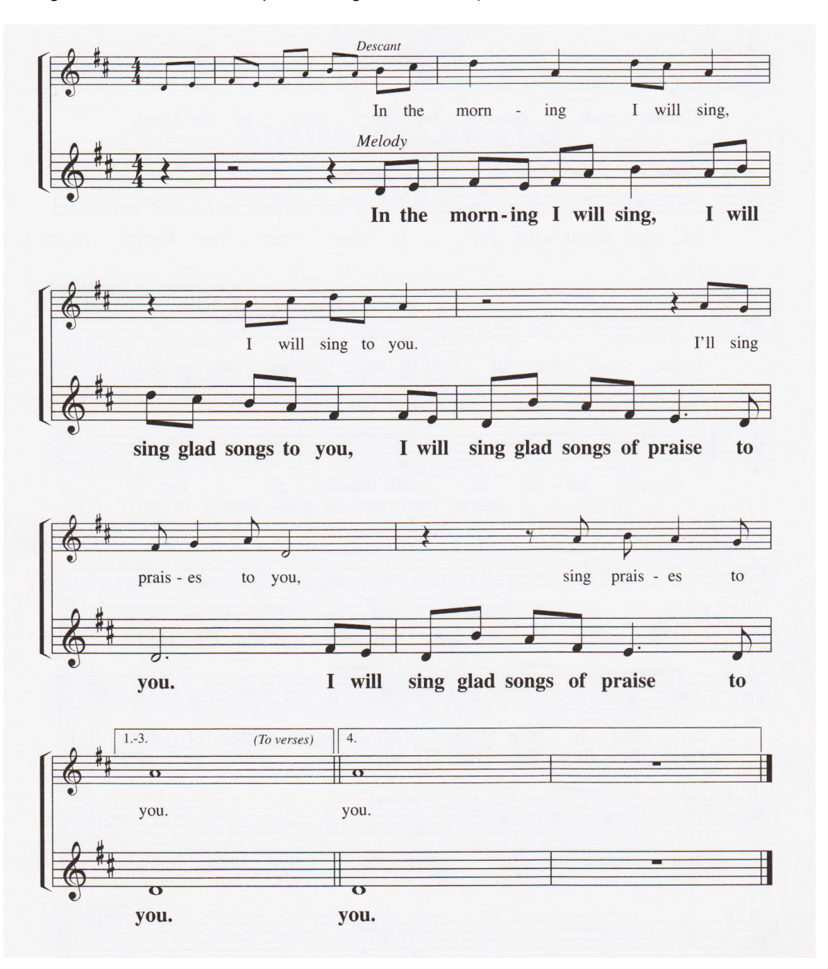
PSALM 63 (The pastor sings the refrain and verse 1. The congregation sings the refrain as occurs throughout the Psalm as the pastor sings the verses.)

Pastor: The Word of the Lord. People: Thanks be to God.